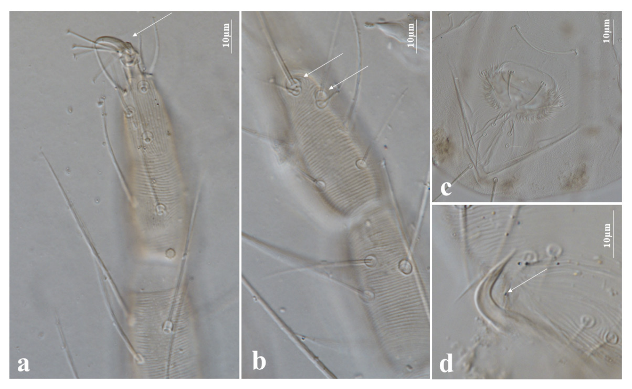
Figure 3. Phase contrast microscope. Female of O. yothersi . a - Empodium of leg I. b - Duplex setae on the tarsus of leg I. c - Anogenital region. d - Male aedeagus.

There was a total of 522 offspring, which the sex ratio was 99.4% females (n= 519) and 0.6% males (n= 3). Our study showed that unfertilized O. yothersi female, under laboratory conditions reproduces by thelytokous /arrhenotokous parthenogenesis, generating low number of males. It is important to emphasize the difference in the previous study where arrhenotoky was observed by Alves et al. (2004). Studies involving sex chromosomes should be done to confirm which form of parthenogenesis occurs in O. yothersi and if it may be variable. Aspects