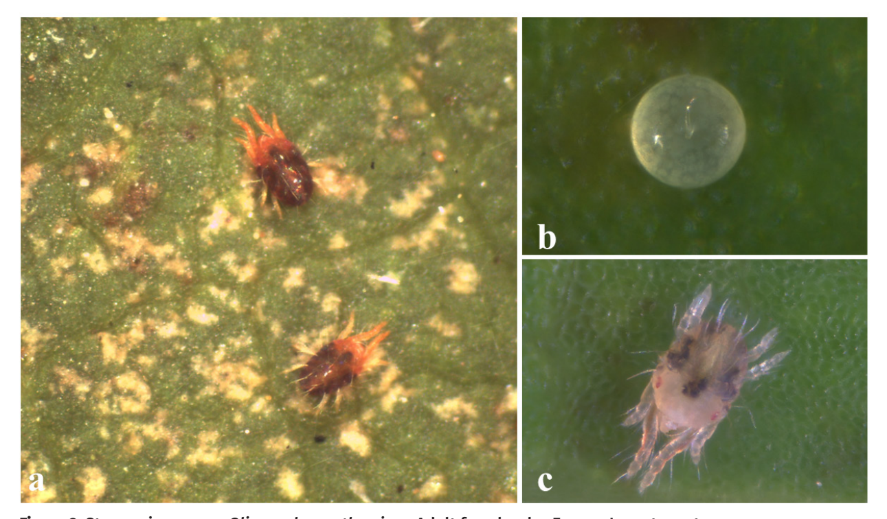
Figure 2. Stereomicroscope. Oligonychus yothersi. a - Adult females. b - Egg. c - Immature stage.