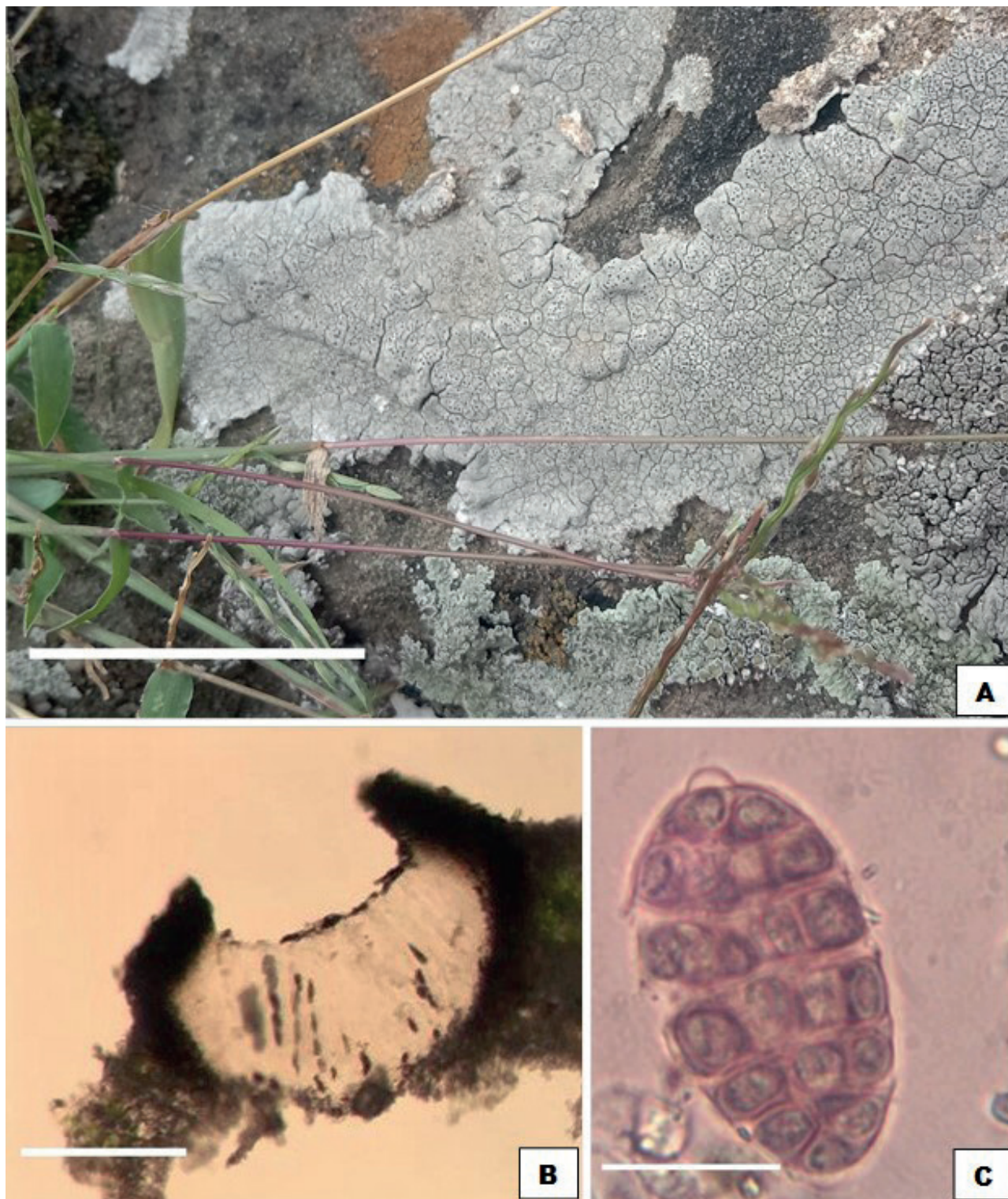
Figure 2. Diploschistes pakistanicus (LAH37419-holotype) A-C: A & B: Showing crustose thallus B: Cross section of apothecium C: Ascospore. Scale bar = A: 3cm, B: 125 µm, C: 20 µm.

Niazi (CKT-04, BLP-15) Gilgit Baltistan, Darel Valley (35°37' N, 73°27'E), 3843 m alt., on rock, October 21, 2020, A. N. Khalid, K. Habib & M. S. Iqbal (DR-40).