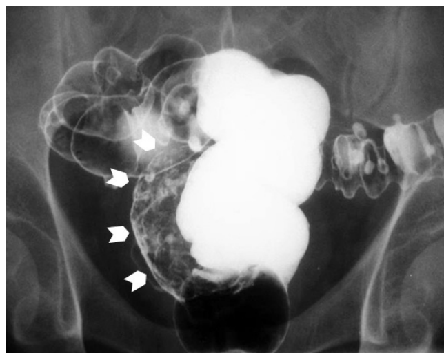
FIGURE 1 - Barium enema presenting diverticular disease of sigmoid colon and a large rectal diverticulum in the anterior wall of the rectum (arrows)

Case 4) A 56 years old male with recurrent episodes of severe pain in anal region, associated with constipation for six months. He also complained urinary alterations. He was a smoker and had no previous medical records. Barium enema and abdominal computed tomography showed diverticular disease of descending and sigmoid colon and a rectal diverticulum in the anterior wall of the rectum (Figure 1).