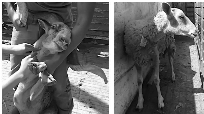
Figure 2. Feral sheep ( Ovis aries ) from Socorro Island, Revillagigedo Archipelago, Mexico.

2020). Sampling was done according to the methodology proposed and described by Payne et al. (1974) for the Compton metabolic profile. The total livestock inventory (94 feral sheep: 84 females and 10 males with an initial body weight [average ± S.D.] of 45 ± 4kg and 60 ± 6kg, respectively) was used (Figure 2).