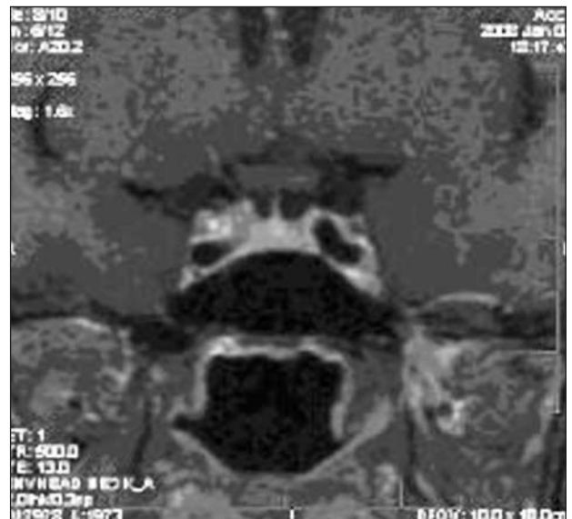
Fig 1. Conventional MRI Spin Echo demonstrating normal pituitary parenchyma

puted tomography (CT) scan of the chest and abdomen disclosed normal tomographic and morphological aspect of the adrenal glands, and a nodular image of 0.8 cm in the central region of the inferior lobe of the left lung, with density of soft parts, slightly wavy contour, and of uncertain evolutive nature and potential. Magnetic resonance images were reconstructed by means of three-dimensional SPGR, exhibiting a 0.4 × 0.3-cm posterolateral right-sided pituitary microadenoma; pituitary stalk with slightly asymmetric implantation corresponding to the anatomic variable (Fig 2). Inferior petrosal sinus sampling (IPSS) was performed after desmopressin stimulation (10 mg IV), which indicated ACTH hypersecretion from the right inferior petrosal sinus (Table). The patient underwent transsphenoidal surgery, with histological confirmation of the pituitary adenoma immunohistochemically positive for ACTH.