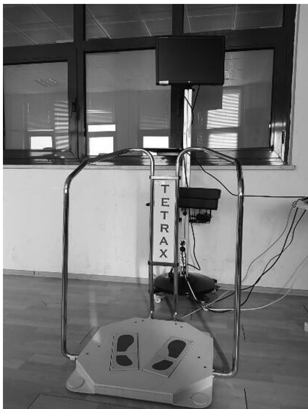
Figure 2 The Tetrax biofeedback system.

dorsiflexors) performed three days per week. The patients were supervised by an experienced physiotherapist to avoid falls.