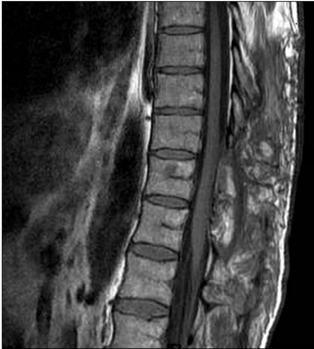
Fig 3. Postoperative T1-weighted sagittal spinal MRI shows the resolution of the pseudomeningocele.

compression 6-9 . A postlaminectomy pseudomeningocele was reported first in 1946 by Hyndman and Gerber in a review of extradural cysts 18 . In 1947, Swanson and Fincher 19 reported the first three cases of pseudomeningocele after a lumbar discectomy. Winkler and Powers 20 reported two additional cases of pseudomeningocele after a lumbar discectomy and treated both patients with an excision of the meningocele and spinal fusion. Myelopathy due to pseudomeningocele was only reported four times, but in all cases the spinal cord compression was located in the cervical region 6-9 .