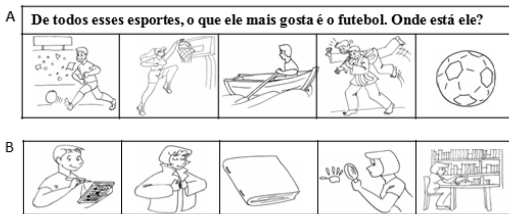
Figure 2. Examples of items from Reading Comprehension (A) and Listening Comprehension (B) subtests of the CTLRC. In A, the sentence to be read is "Of all these sports, what he likes most is soccer. Where is it?" In B, the sentence to be listened is "The woman is studying in the library".

Contrastive Test of Listening and Reading Comprehension (CTLRC). The CTLRC (Capovilla & Seabra, 2013) assesses listening and reading comprehension skills. The comparison between the two skills enables the differential diagnosis of reading acquisition disorder, differentiating it from general language disturbance. The instrument consists of two subtests: Reading Comprehension (RC) and Listening Comprehension (LC), each with 40 test items arranged in order of increasing difficulty. Figure 2 presents an example of each subtest. For each item, the child must choose between five alternative figures, the one that corresponds to the sentence heard in the case of the LC subtest or read in the case of the RC. Seabra, Dias, and Capovilla (2013) presented reliability indices ( \alpha \geq .86 to LC, and \alpha \geq .97 to RC), validity evidence (school grade effects, correlation with other variables), and normative data (6 to 11 years old) on the CTLRC. The scores computed for the CTLRC were the correct answers. For analysis, we used the total score in each part of the test (0-40).