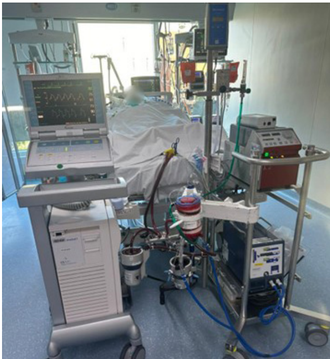
Fig. 2 - Patient in pre-transplantation status with intra-aortic balloon pump and veno-arterial extracorporeal membrane oxygenation support, Interagency Registry for Mechanically Assisted Circulatory Support (or INTERMACS) 1.

The evolution of organ allocation policies, exemplified by the United Network for Organ Sharing (or UNOS), reflects the dynamic nature of medical decision-making. The emphasis on granular listing criteria and improved risk stratification has led to a surge in the utilization of temporary MCS, notably IABP, as a bridge to transplantation (Figure 2). However, disparities in mortality risk among listed patients underscore the need for continued